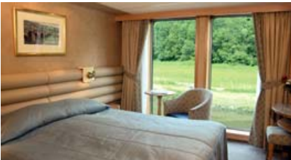
Deluxe Outside Cabin Cat. 1 Stateroom pictured