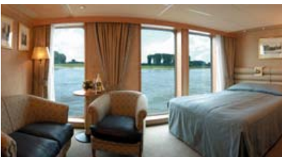
Category L; Suite Stateroom