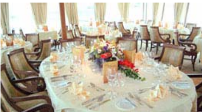
River Countess Main Dining